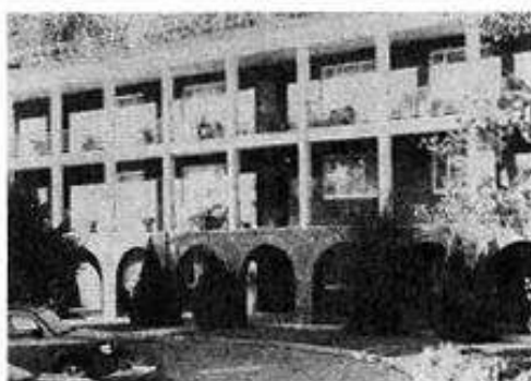
Ranked as one of the seven natural wonders of the world, the "natural bridge" (left) is 215' tall. The ground level patio rooms (bottom right) are perfectly arranged for motorcyclists, with motorcycle only parking along the curb.

and motorcyclists even get a 20% rate discount, called "The Two Wheel Steal," Sunday through Thursday. Other riding groups, such as the Concours Owner's Group and The Motorcycle Tour Company of Virginia, have chosen the Natural Bridge Inn for their gatherings, too.